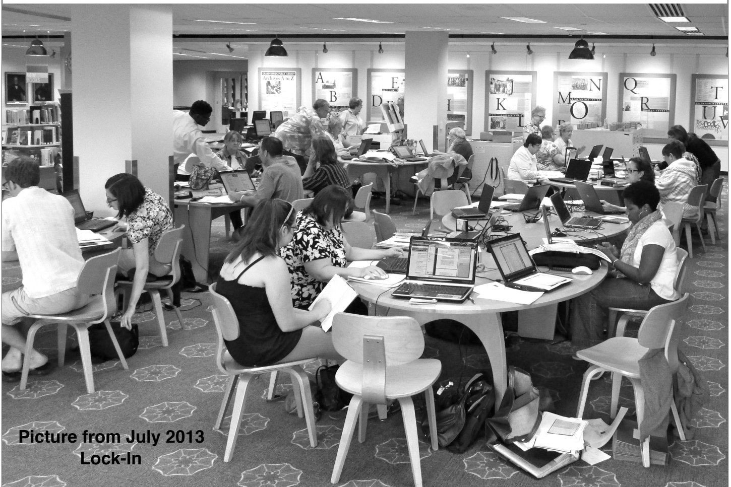
Picture from July 2013 Lock-In

This is a very popular event with a long waiting list. If you register for this event and later learn that you are unable to attend, PLEASE call the GRPL to let them know you won't be attending and give someone else the chance to attend.